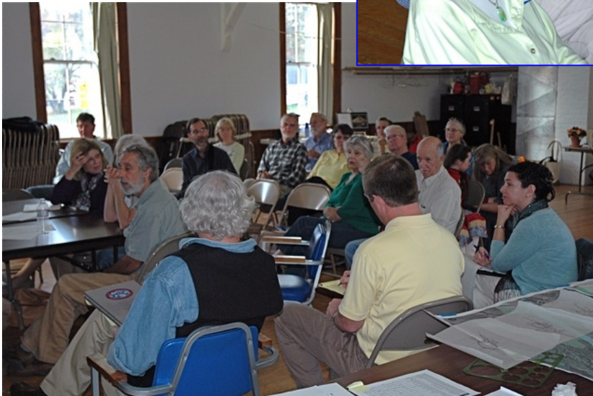
Many local citizens share their ideas at one of two public sessions on Friday